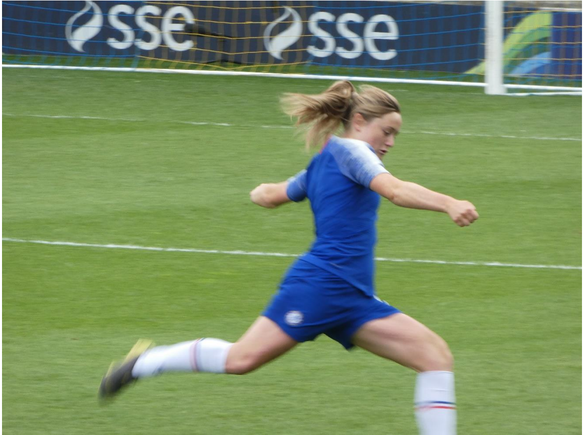
Above: Footballer Erin Cuthbert in 2019.